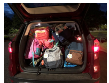
We filled MANY book bags!