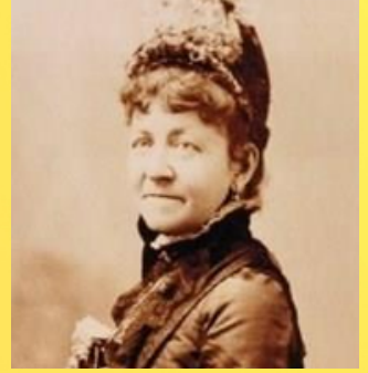
Jane Cunningham Croly aka Jennie June Organized the GFWC in 1890