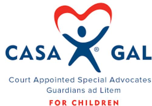
Members wore blue for child abuse prevention awareness