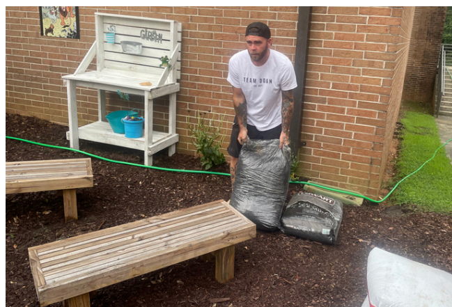
SARDIS GARDEN WORK DAY TO GET READY FOR THE KIDS TO COME BACK TO SCHOOL!

We would like to do a project with the Sardis Special Education class before the end of this year. Please go online to the hallcounty.compliancedirector.org and complete the three modules: Child Sexual Abuse & Assault Awareness/Prevention, Mandated Reporting, and Suicide Awareness & Prevention. These modules must be completed and documentation either printed or emailed to the school each school year. Thanks!